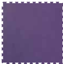
PAVIGYM PURPLE-C1. 157.029A