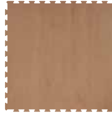
PAVIGYM BEECHWOOD-C1. 157.014A