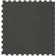
PAVIGYM STONE GREY-C1. 157.019A