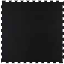
PAVIGYM JET BLACK-C1. 157.011A