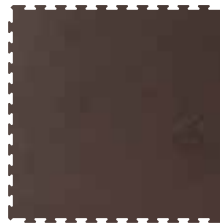
PAVIGYM AUTUMN BROWN-C1. 157.043A