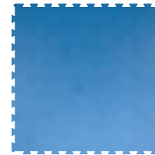
PAVIGYM CYAN-C1. 157.037A