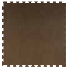
PAVIGYM WALNUT-C1. 157.022A