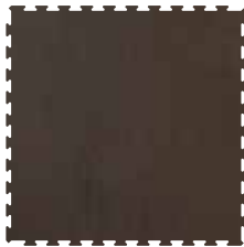
PAVIGYM WENGUE-C1 157.013A