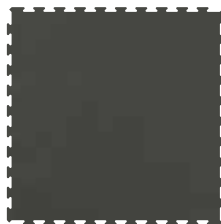
PAVIGYM STONE GREY-C1. 157.019A