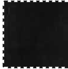
PAVIGYM BLACK MARBLE-C1. 157.024A