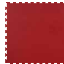
PAVIGYM RED-C1. 157.027a