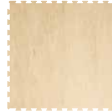
PAVIGYM BAMBOO-C1. 157.021A