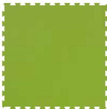
PAVIGYM LIME-C1. 157.030A