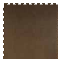
PAVIGYM WALNUT-C1. 157.022A