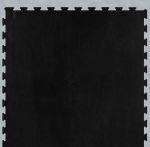
PAVIGYM B. MARBLE