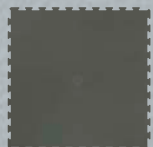
PAVIGYM STONE G.